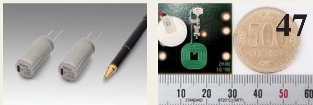
UXY Series capacitors (page 45)