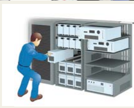
Energy storage system (page 12)