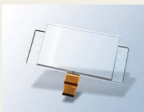
Glass sensor (page 38)