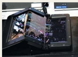
Foldable AMOLED display (page 55)