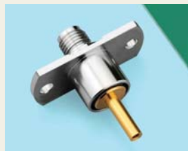
Coaxial connector (page 21)